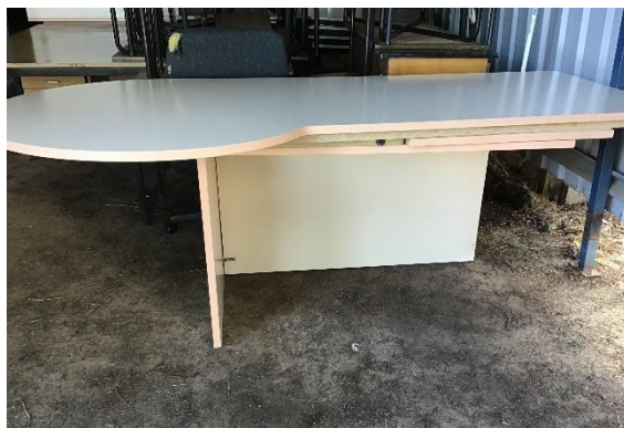
One large desk unit