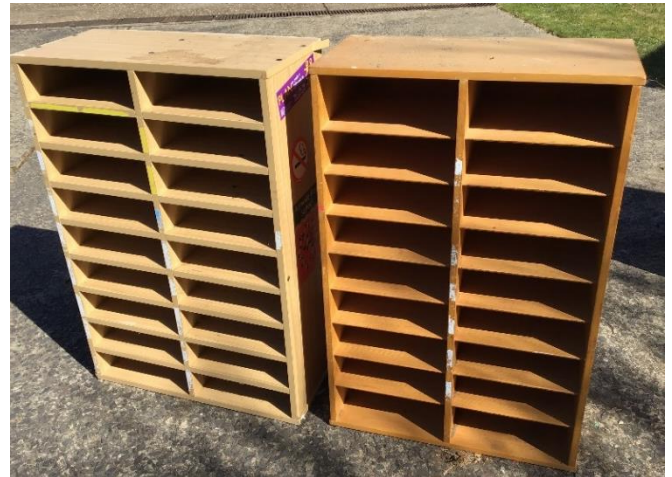
Two Pigeon hole shelf units