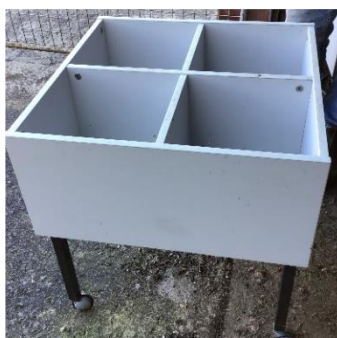
Two Square storage tub