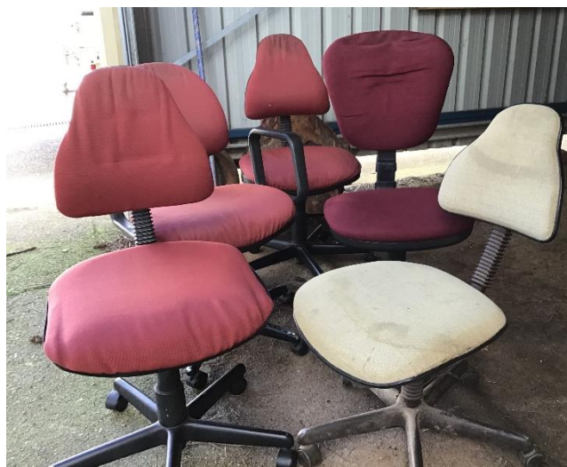
Five office chairs