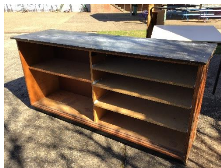
Bench with shelves 177 cm length x 87 cm high x 54 cm width