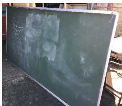
Chalkboard 2.4 metres x 1.25 metres