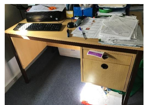
Teachers desk with drawers