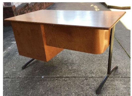
Rear view of teacher's desk