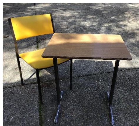
Three small school desks brown in colour