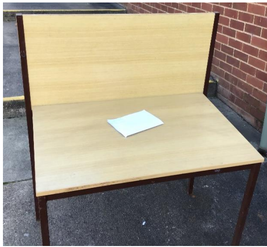
Desk with back