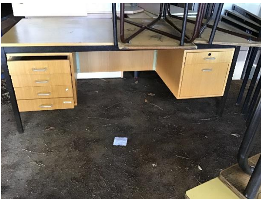
One large desk with draws