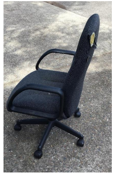
One office chair on wheels