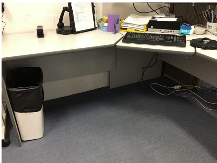
Two modular computer desks similar to this photo