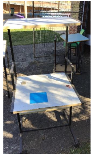
Computer work station