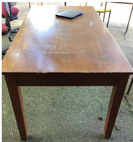
One Wooden table