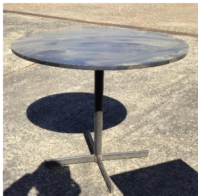
One round table