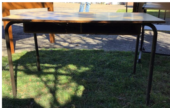
School desks with shelves