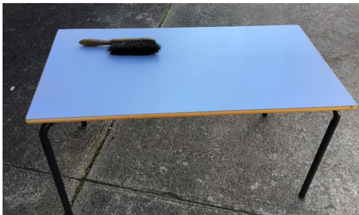
Small child's desk