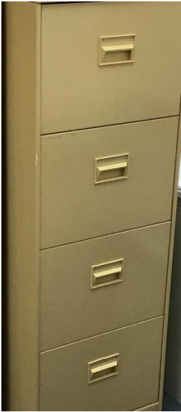
Four x four draw filing cupboard