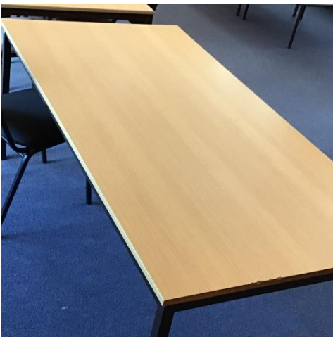
One large table