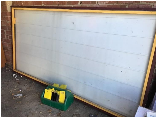
Notice board complete with letters 2.4 metres length x 1.2 metres high