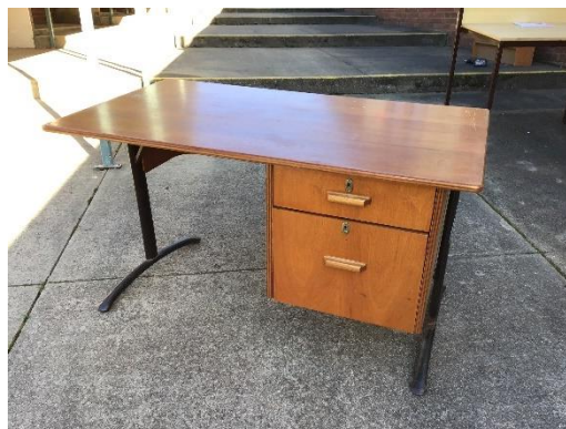
Front of teacher's desk