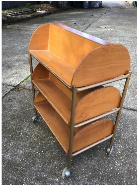
One mobile shelf unit