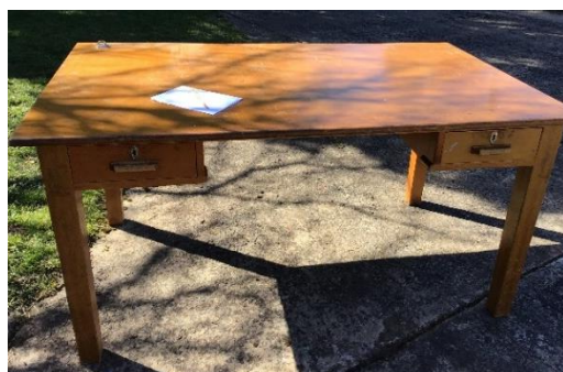
Wooden desk with two drawers