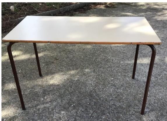
Twenty-nine double school desks