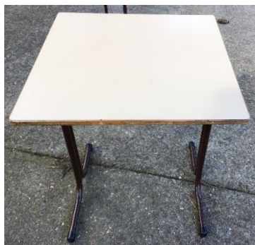
One small square table buff in colour