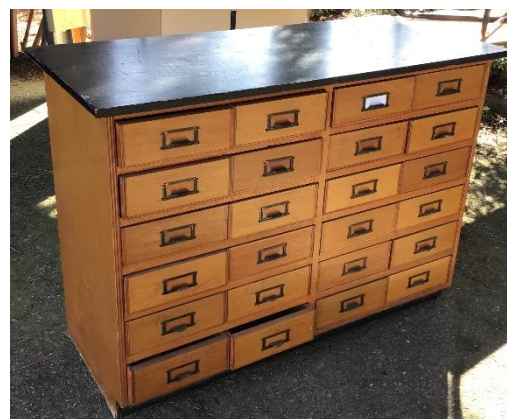
Science bench chest of drawers