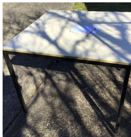
Six square tables 900 mm x 900 mm