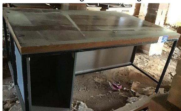
Desk with wooden top-drawers missing