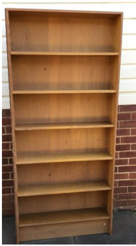
Two bookcases 2 metres tall